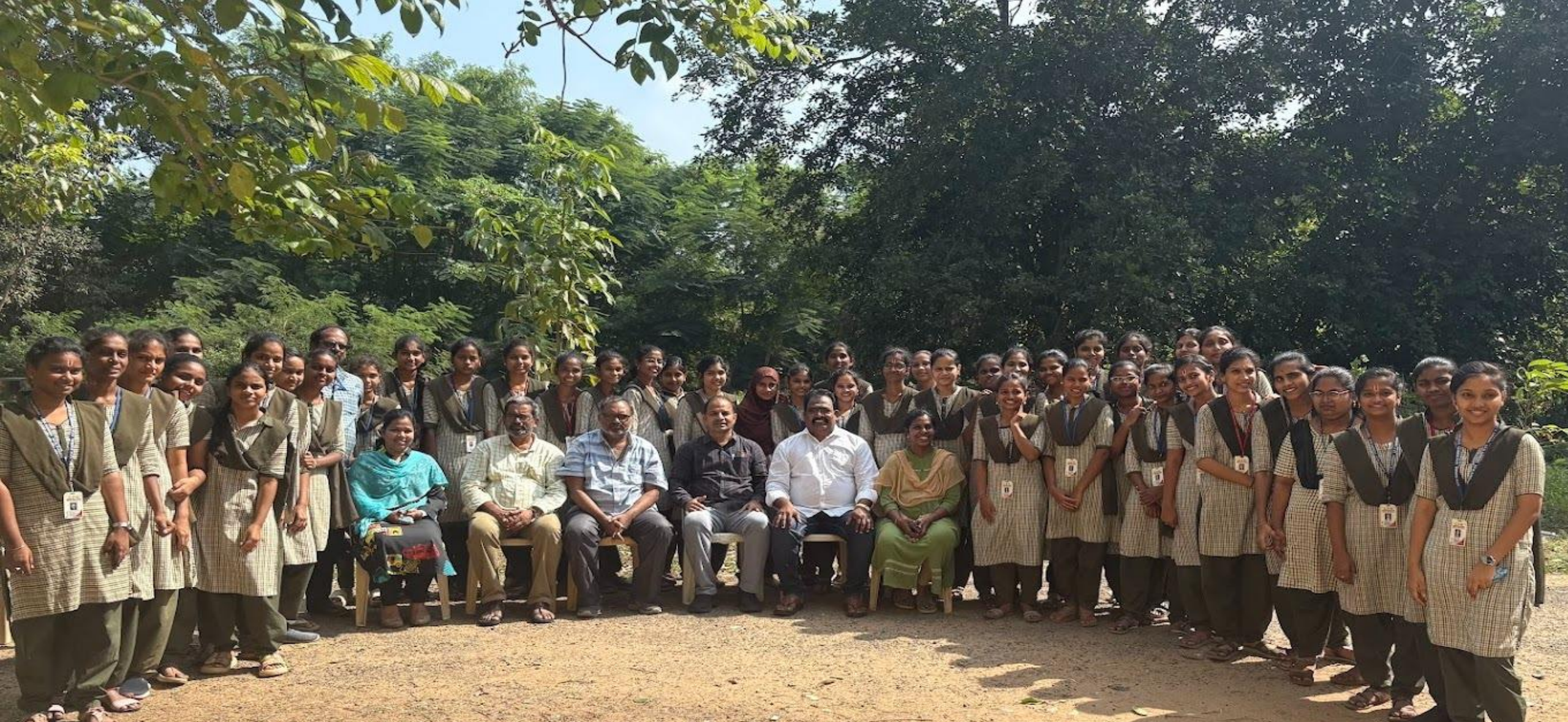
2023-2026 BATCH STUDENTS WITH FACULTY MEMBERS